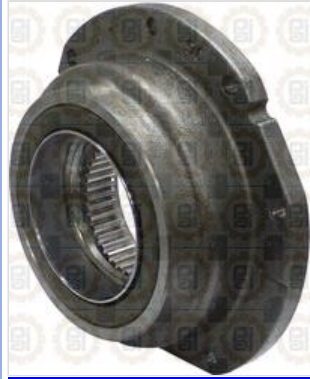
Water Pump, Thermostats and Oil Pump 2017 DT466E / 530E Oil Pumps - Oil Pumps