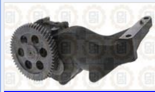
Water Pump, Thermostats and Oil Pump 2017 60 Series Oil Pumps - Oil Pumps