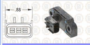
Sensor Catalog 2019 Differential Pressure Sensors - Sensor Catalog