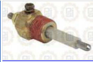
Cab Catalog Radiator Water Level