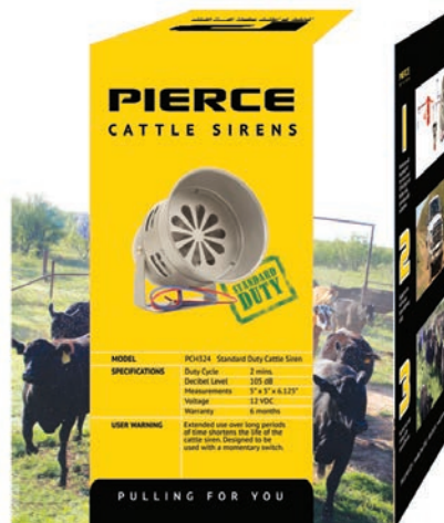
PCH324 5.63" x 5.63" x 7.15"