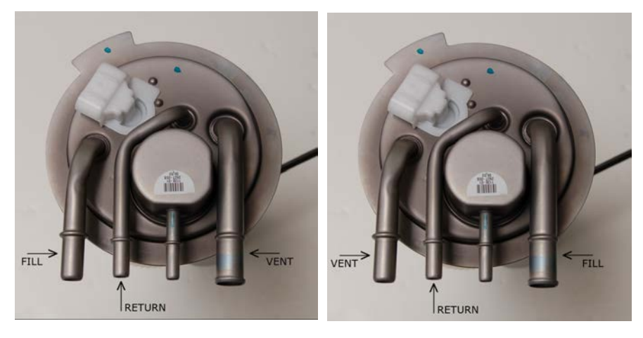
Stock sending unit configuration