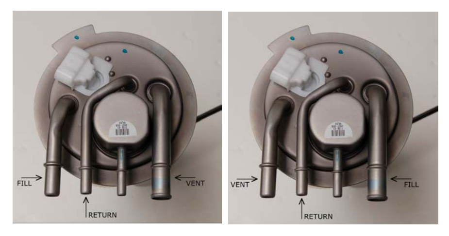
Stock sending unit configuration