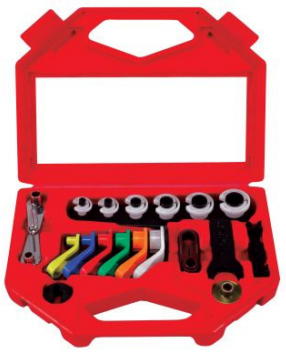
GM Fuel Line Disconnect Tool (Matco Set Pictured)

NOTE: Before beginning installation, you will need two disconnect tools for fuel lines. The BLUE tool in the figure below corresponds to 3/8" diameter and is used to remove the return line; the RED tool in the figure below corresponds to 1/2" diameter and is used to remove the fill line. You can purchase these tools at any auto parts store or Snap-on, Mac or Matco.