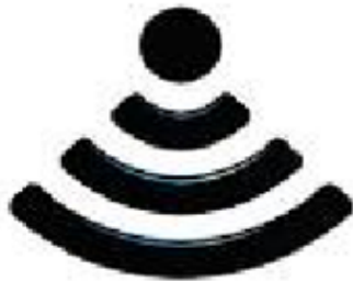
Receiver display unit