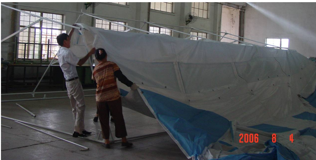
ALL cover put on including outside cover