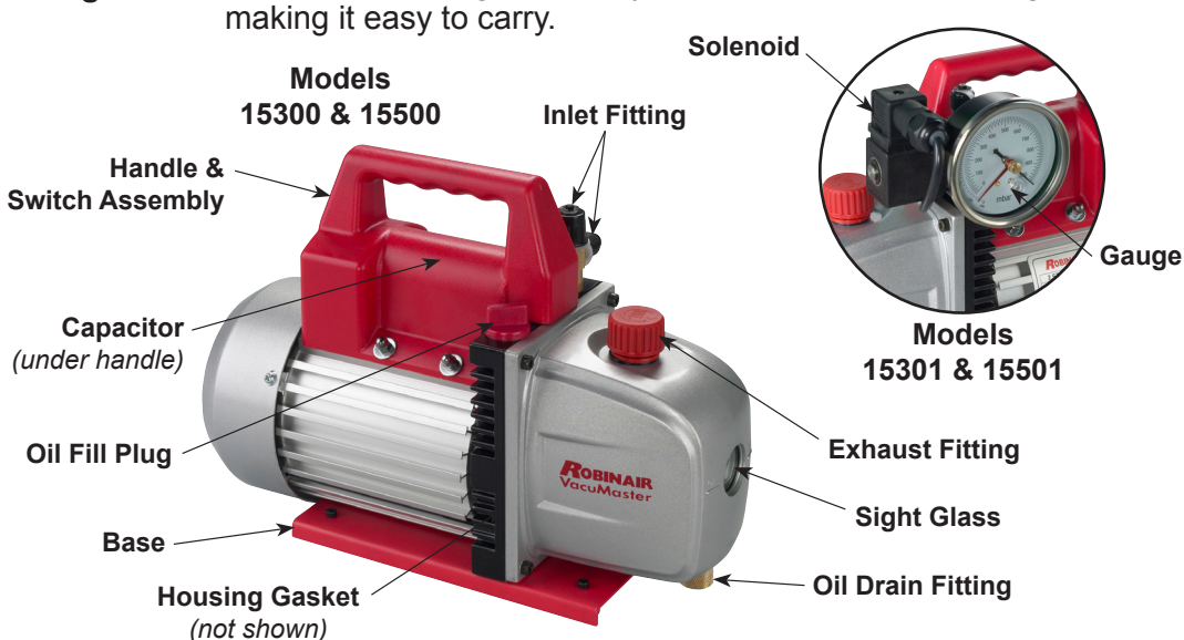
Inlet Fitting Adapter (included but not shown).

Aluminum housing and rotary vanes keep the pump weight low,