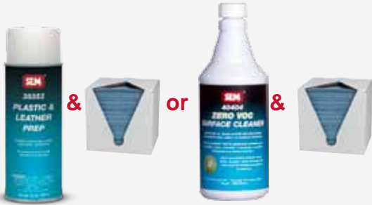
3835( ) PLASTIC & LEATHER PREP & lint free towels or 4040( ) ZERO VOC SURFACE CLEANER & lint free towels