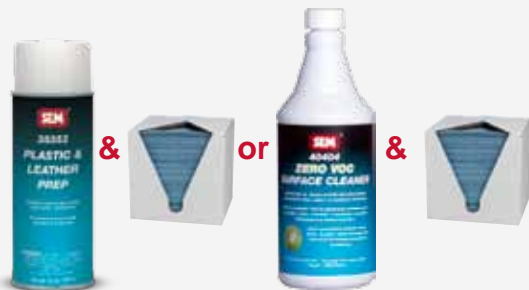
3835( ) PLASTIC & LEATHER PREP & lint free towels or 4040( ) ZERO VOC SURFACE CLEANER & lint free towels