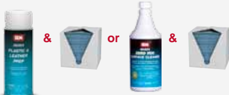
3835( ) PLASTIC & LEATHER PREP & lint free towels or 4040( ) ZERO VOC SURFACE CLEANER & gray scuff pads