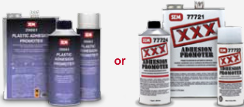
3986( ) PLASTIC ADHESION PROMOTER or 7772( ) XXX ADHESION PROMOTER