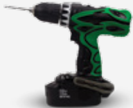
Drill with 1/8" bit