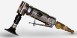
Grinder with 36-40 grit disc