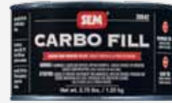
39542 CARBO FILL