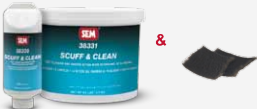
3833( ) SCUFF & CLEAN & gray scuff pads