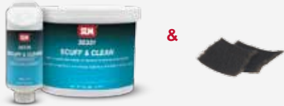
3833( ) SCUFF & CLEAN & gray scuff pads