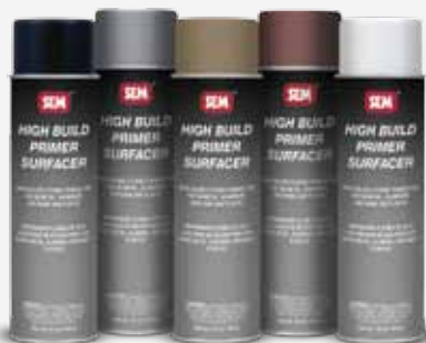
3913( ) FLEXIBLE PRIMER SURFACER or 420( )3 HIGH BUILD PRIMER SURFACER