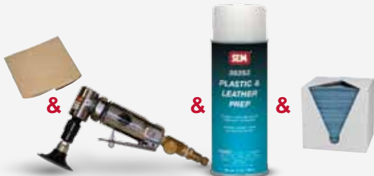
80 grit sand paper & a grinder with 36-40 grit disc & 3835( ) PLASTIC & LEATHER PREP & lint free towels