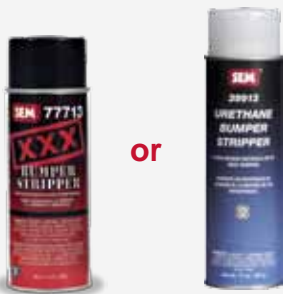
77713 XXX BUMPER STRIPPER or 39913 URETHANE BUMPER STRIPPER