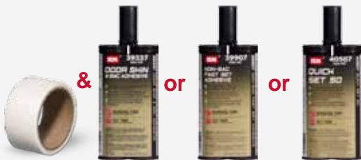
70006 PLASTIC REPAIR REINFORCING TAPE & 39337 DOOR SKIN & SMC ADHESIVE or 39907 NON-SAG FAST SET ADHESIVE or 4050( ) QUICK SET 50

Application Guns Available: 70019 1.7 OZ MANUAL APPLICATOR GUN 70039 UNIVERSAL PNEUMATIC APPLICATOR GUN 71119 UNIVERSAL MANUAL APPLICATOR GUN