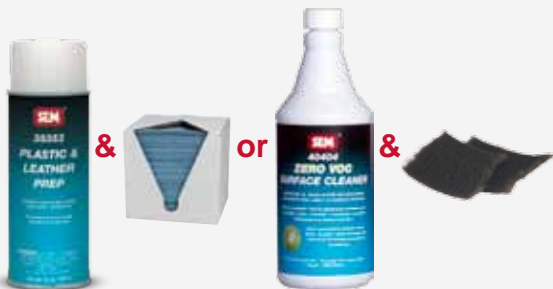
3835( ) PLASTIC & LEATHER PREP & lint free towels or 4040( ) ZERO VOC SURFACE CLEANER & gray scuff pads