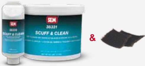
3833( ) SCUFF & CLEAN & gray scuff pads