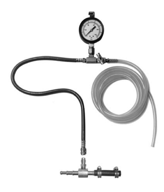
NOTE: This is only one of several hook-ups which can be made.