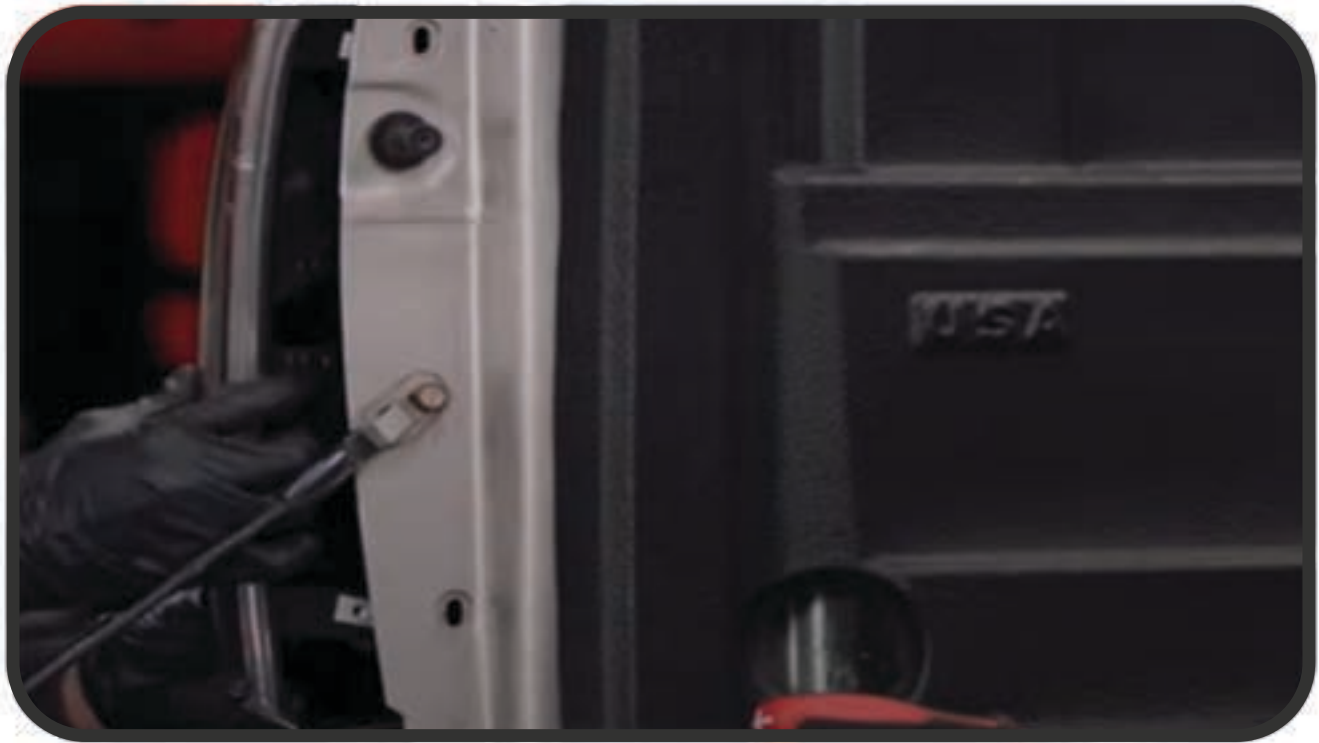
STEP 6: SEAT SPYDER TAIL LIGHT