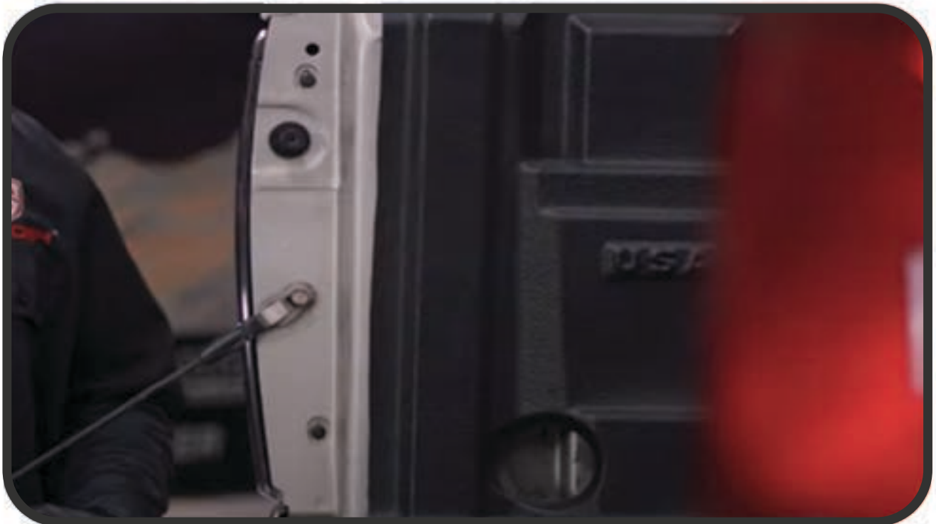
STEP 7: REINSTALL (2X) PHILLIPS SCREWS SECURING TAIL LIGHT