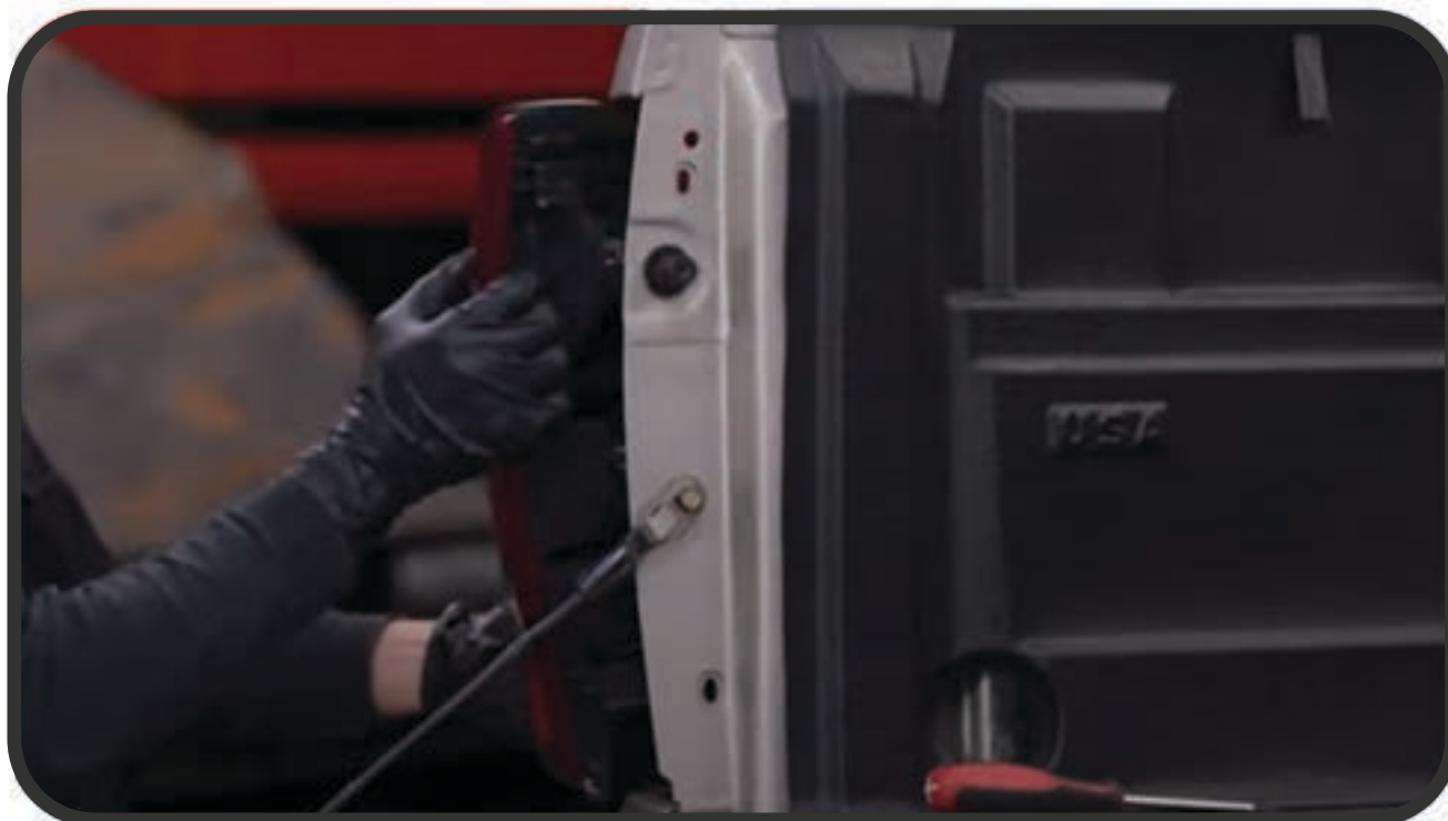
STEP 3: UNSEAT TAIL LIGHT