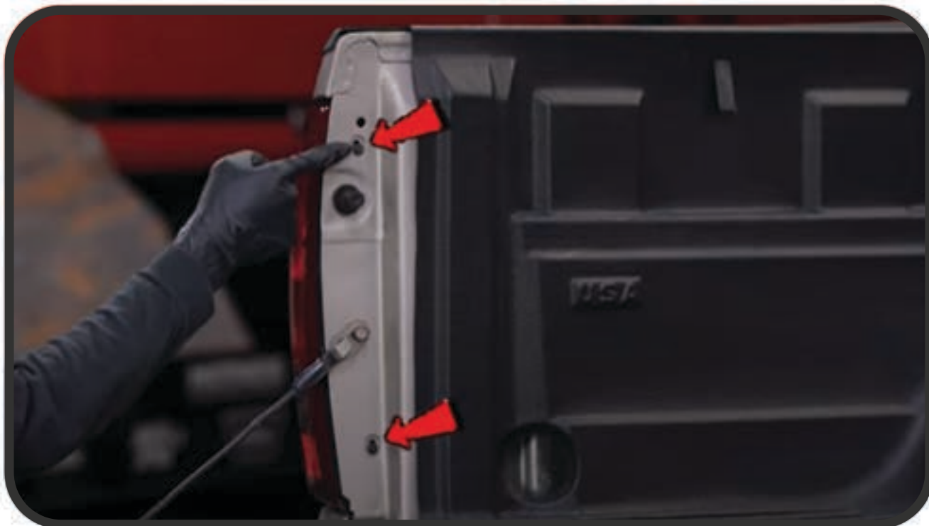
STEP 2: REMOVE (2X) PHILLIPS SCREWS