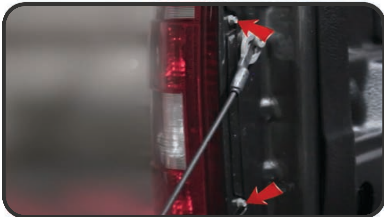
STEP 2: REMOVE (2) 8MM BOLTS