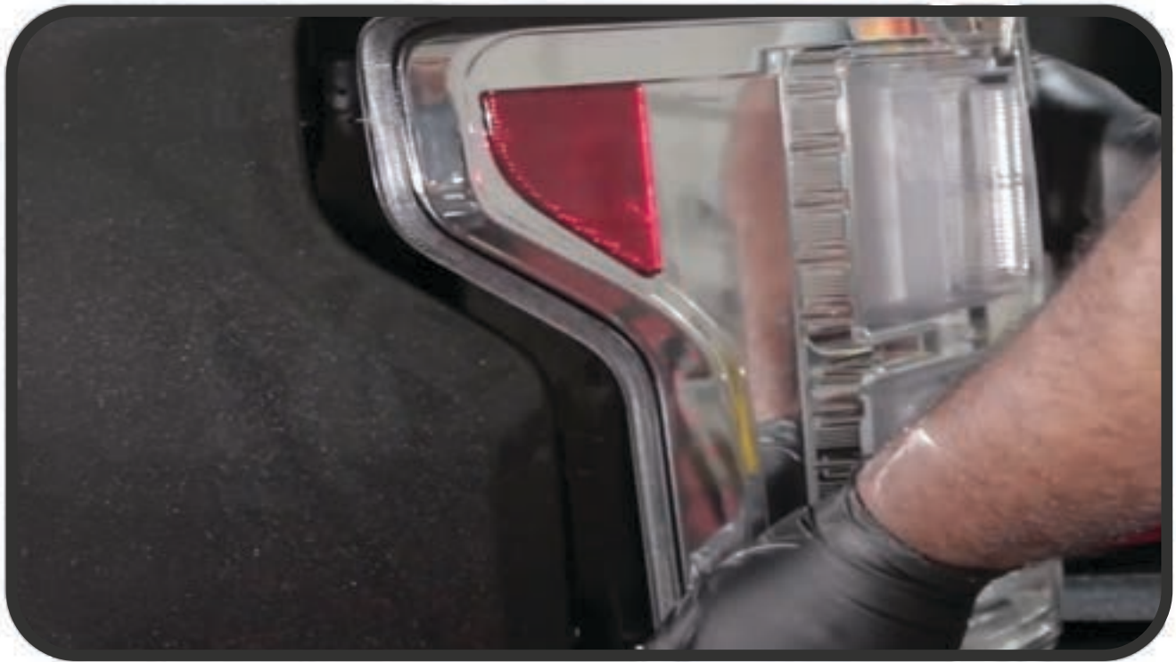
STEP 6: SEAT SPYDER LED TAIL LIGHT ASSEMBLY IN PLACE