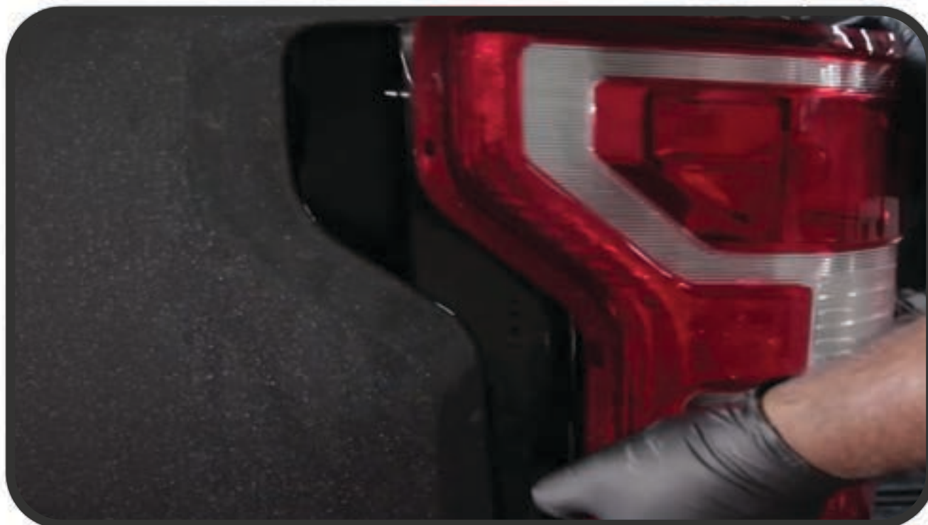
STEP 3: UNSEAT TAIL LIGHT