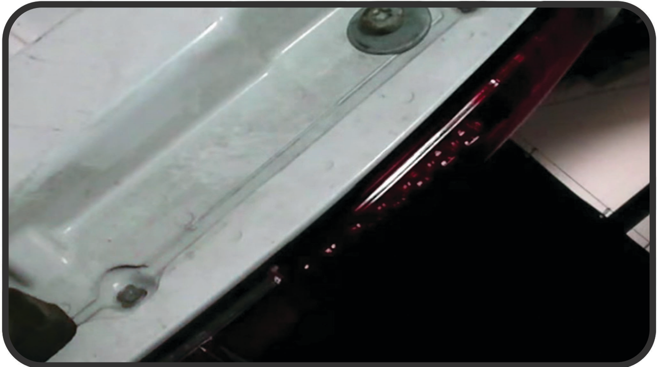
STEP 9: REINSTALL THE (2) 10MM BOLTS TO SECURE THE TAIL LIGHT