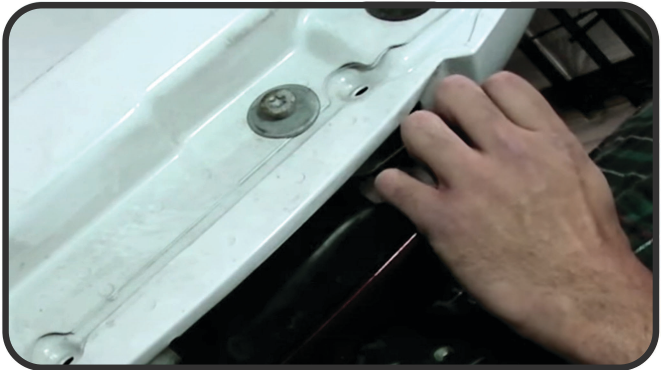
STEP 8: SEAT THE TAIL LIGHT