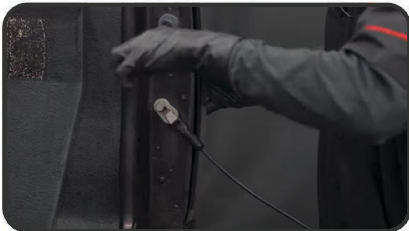
STEP 9: REINSTALL (2) T15 SCREWS