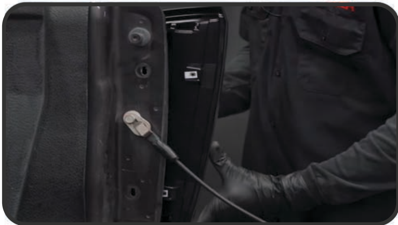
STEP 8: SEAT SPYDER TAIL LIGHT