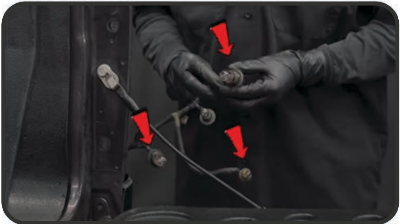
STEP 5: REMOVE BULBS FROM TOP AND BOTTOM BRAKE/SIGNAL AND ALSO SIDE MARKER BULB