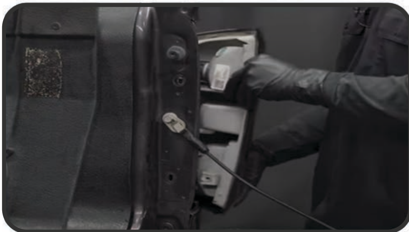
STEP 3: UNSEAT TAIL LIGHT