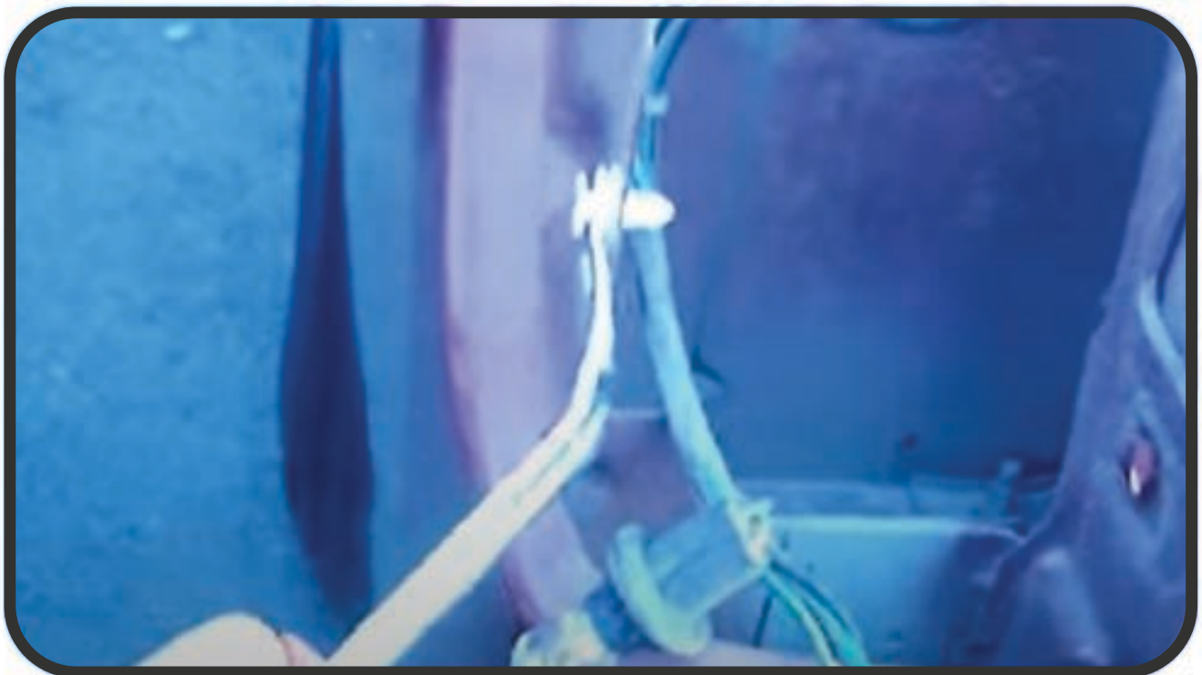
STEP 5: USE PANEL POPPER TO REMOVE (2) PLASTIC RETAINERS