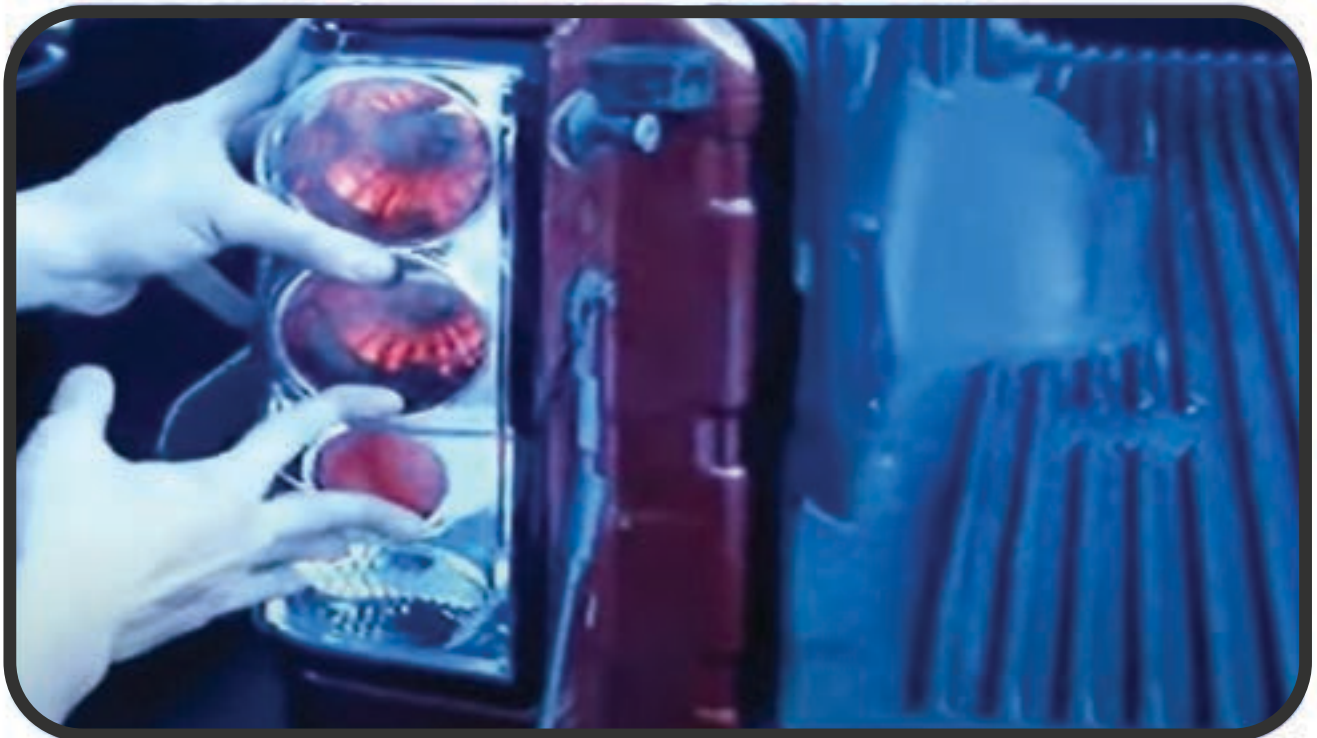
STEP 7: SEAT SPYDER TAIL LIGHT