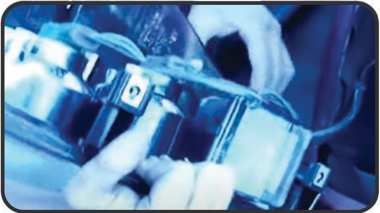
STEP 6: INSTALL (3) BULB SOCKETS INTO SPYDER TAIL LIGHT