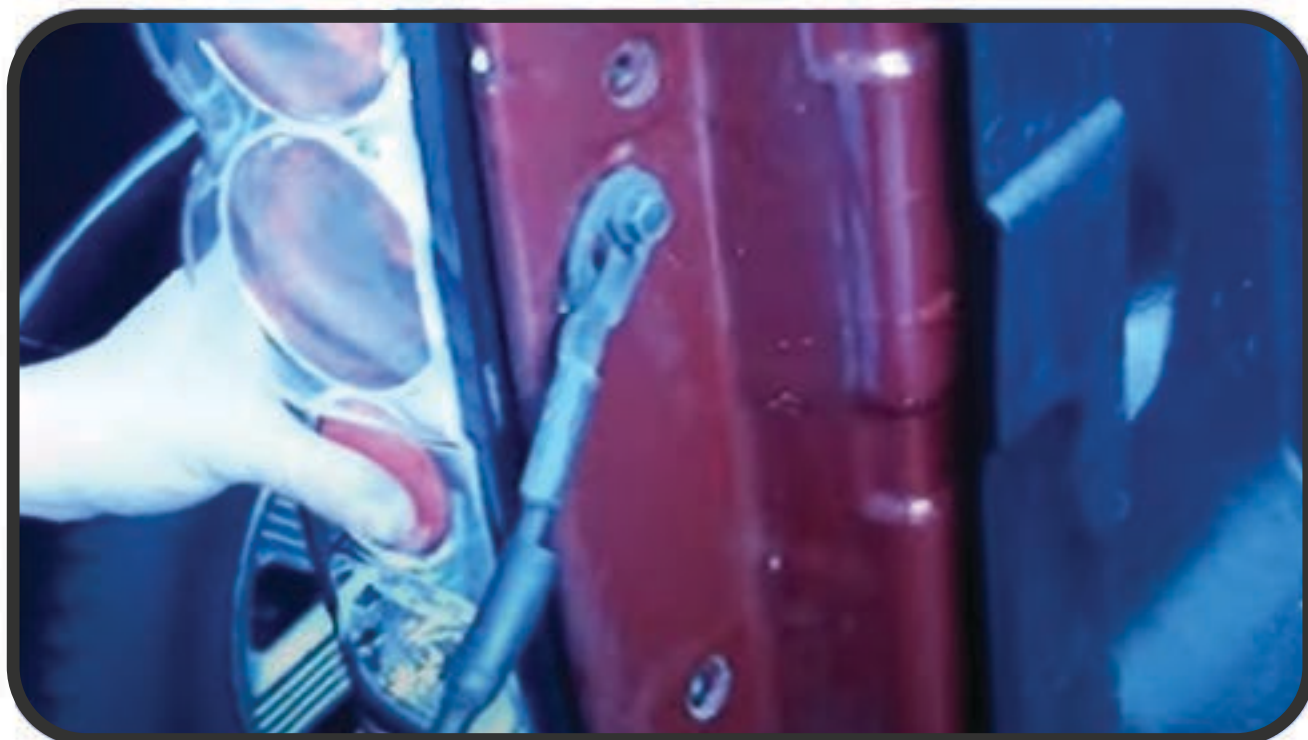
STEP 8: INSTALL (2) 10MM BOLTS