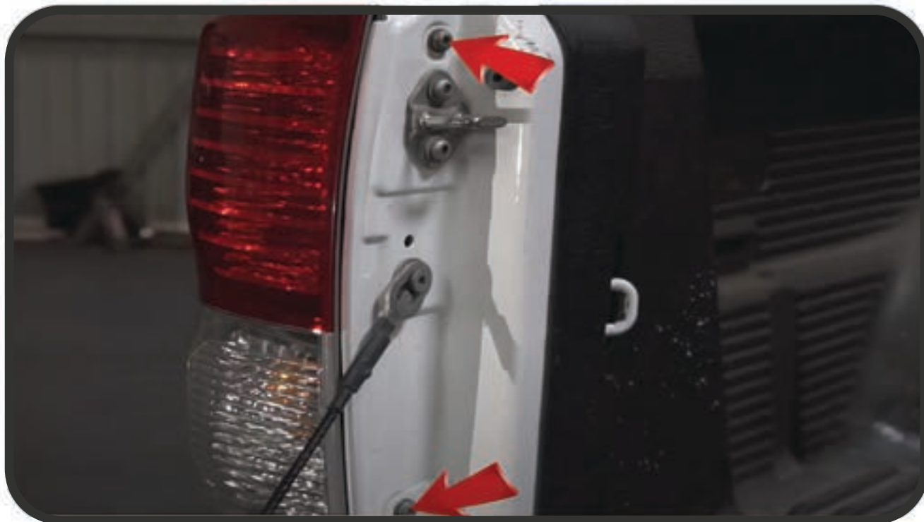
STEP 2: REMOVE (2) T27 TORX SCREWS