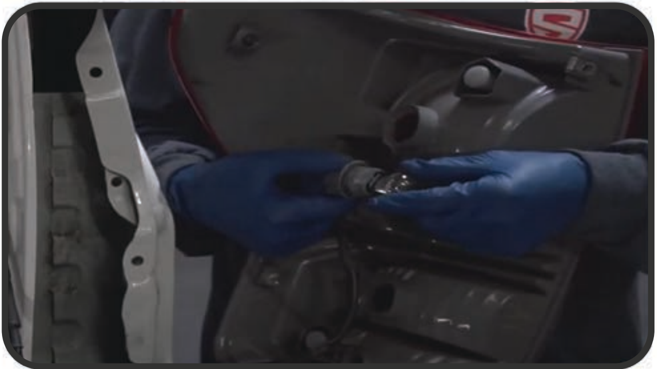
STEP 5: REMOVE BULB FROM BRAKE SOCKET