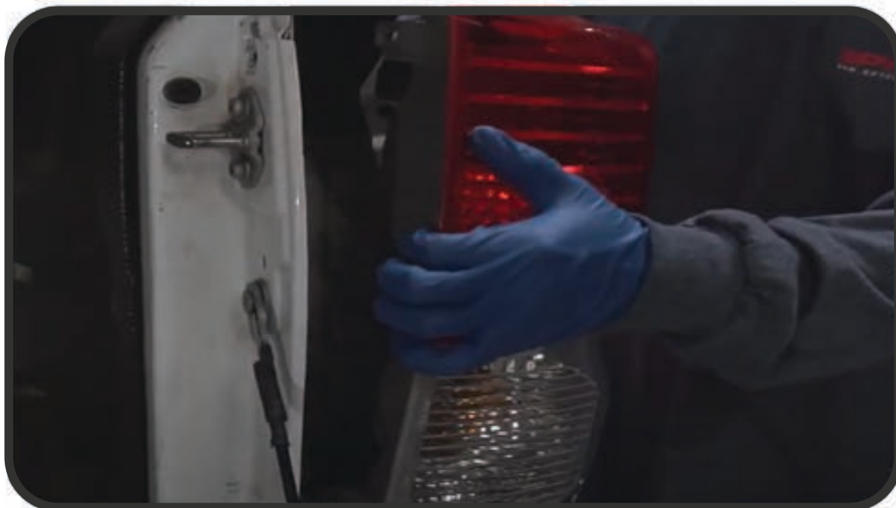
STEP 3: UNSEAT TAIL LIGHT