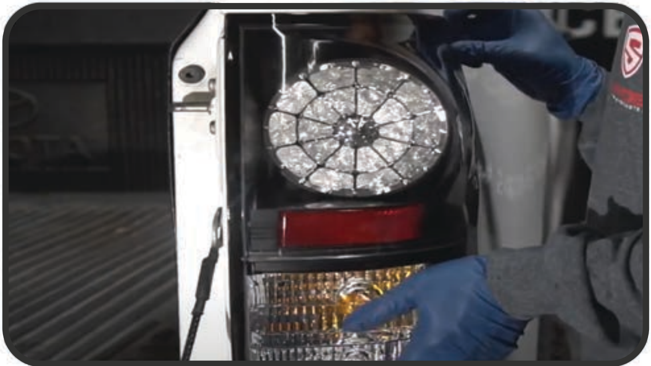
STEP 8: SEAT SPYDER TAIL LIGHT