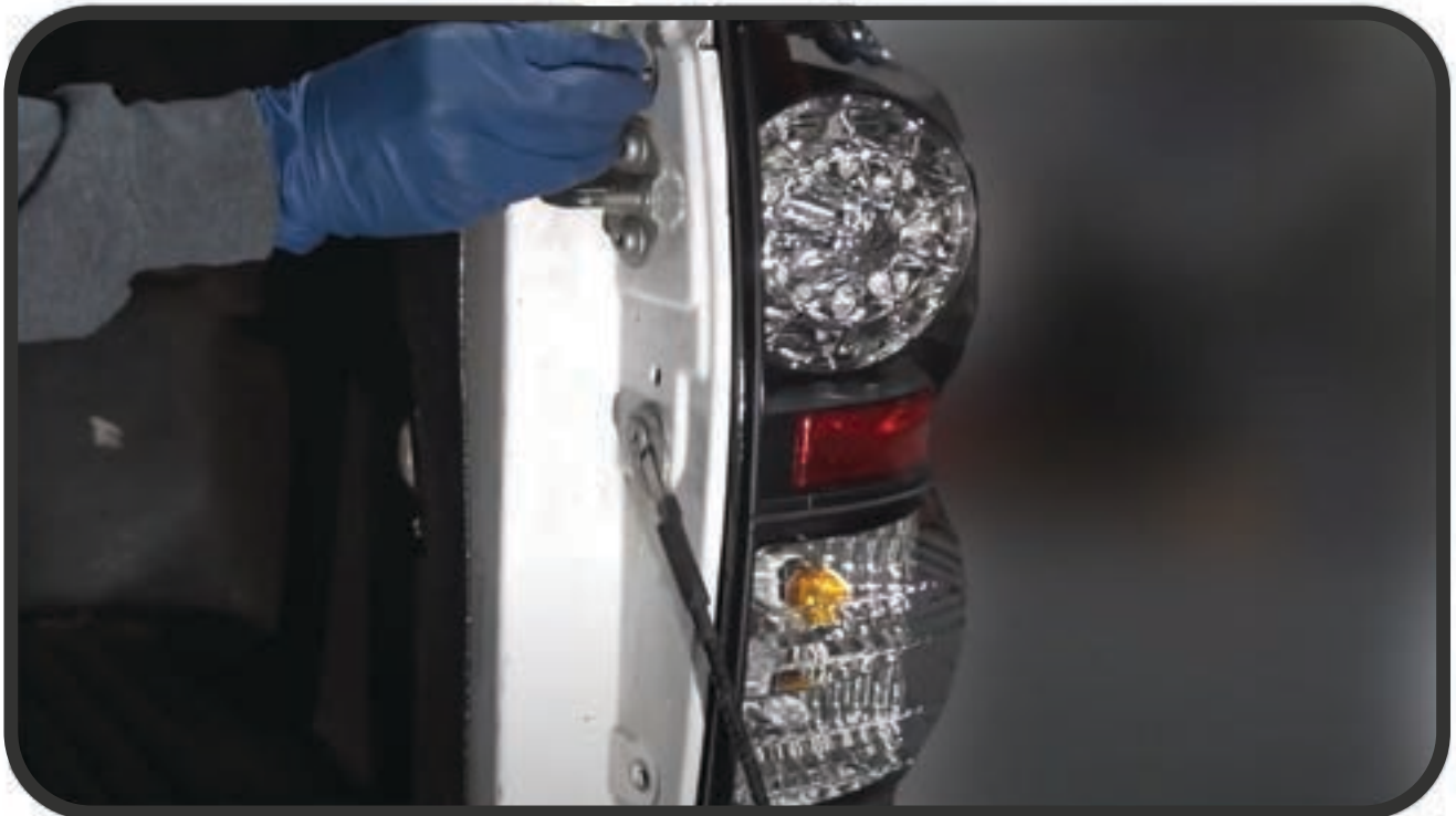
STEP 9: REINSTALL (2) T27 TORX SCREWS