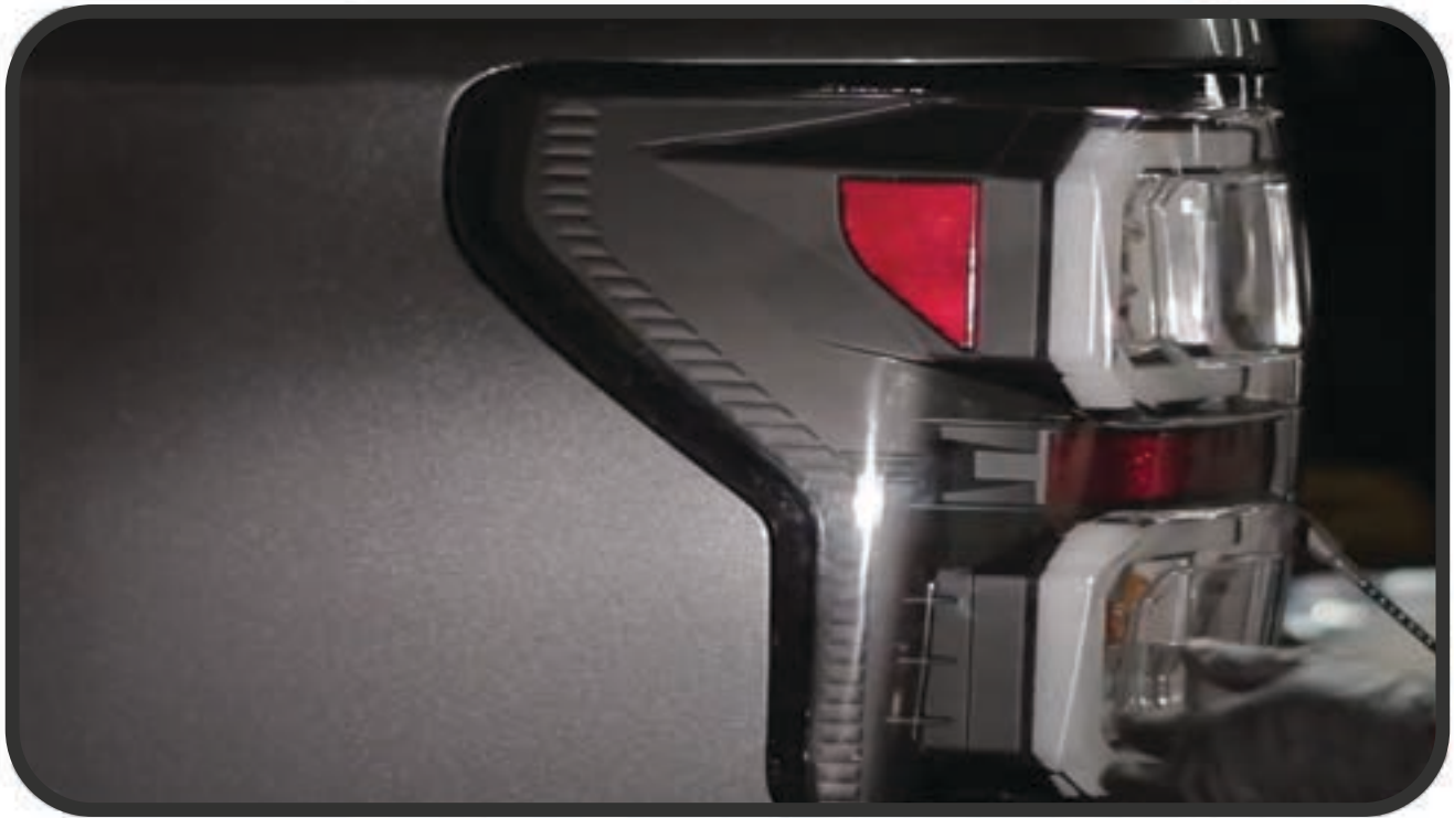
STEP 8: SEAT SPYDER TAIL LIGHT