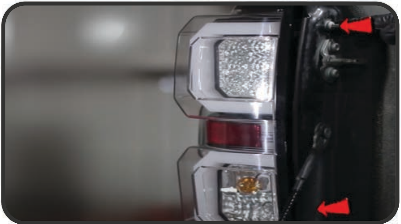
STEP 9: REINSTALL (2) T30 TORX SCREWS