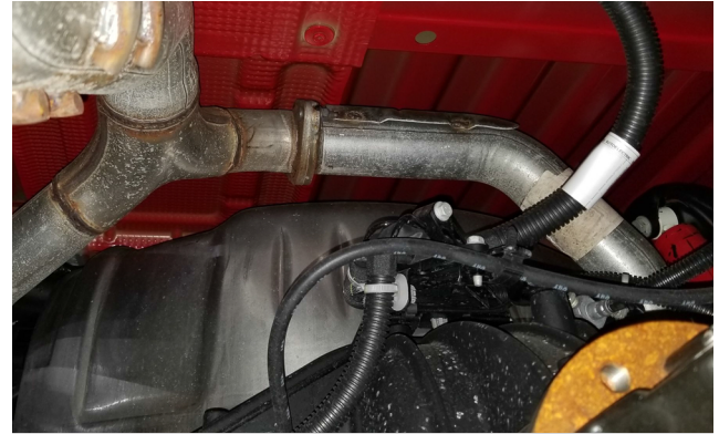
Detail 4: Left tail OEM flange connection