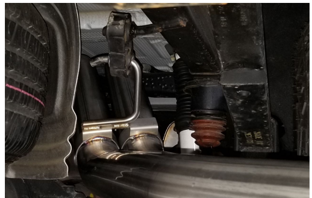
Detail 13: Rear tail hanger assembly, viewed from rear of vehicle.