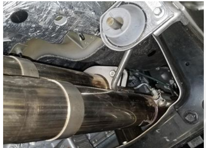
Detail 11: Inlet connection and X-pipe installed