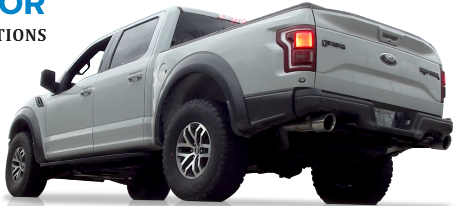
Ford Raptor Catback System

Thanks for purchasing a Stainless Works Catback system for your 2017+ Ford Raptor. Our team has done our very best to ensure that this product is the premium in performance, quality, and fitment. We are proud to say that this system will unleash the true character of your vehicle. We encourage you to read through the following steps, and check the included Bill of Materials before beginning. Please follow these steps to ensure that your installation goes as planned.