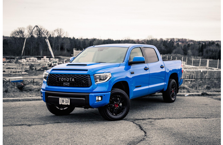
2019+ Toyota Tundra TRD Pro CrewMax SR5 (TOYT14XXX)

Thanks for purchasing a Stainless Works catback exhaust system for your 2014+ Toyota Tundra. Our team has worked to ensure that this product is the premium in performance, quality, and fitment. We are proud to say that this system will unleash the true character of your vehicle. We encourage you to read through the following steps, and check the included Bill of Materials before beginning. Please follow these steps to ensure that your installation goes as planned.