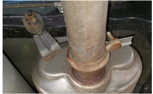
Detail 3: Rear OEM tailpipe connection