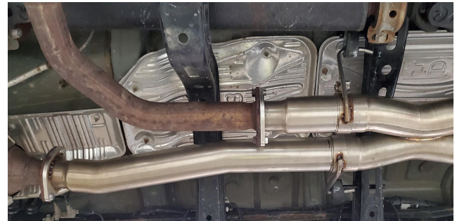
Detail 7/8: Factory connection; X pipe & hanger clamps shown