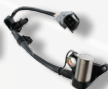
Toyota Crankshaft Sensor PC78