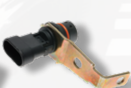
GM Crankshaft Sensor PC123