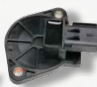
Chrysler Camshaft Sensor PC475