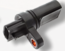
Nissan Camshaft Sensor PC464