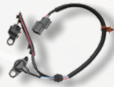
Honda Crankshaft Sensor PC133