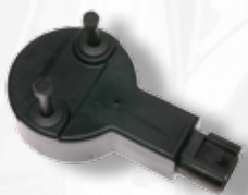
Ford Camshaft Sensor PC321