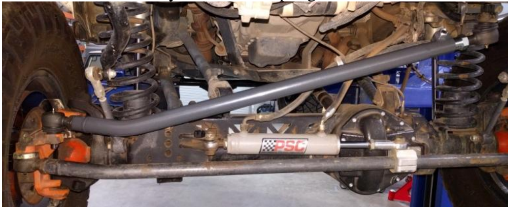
Figure 7. INCORRECT Orientation of Drag Link