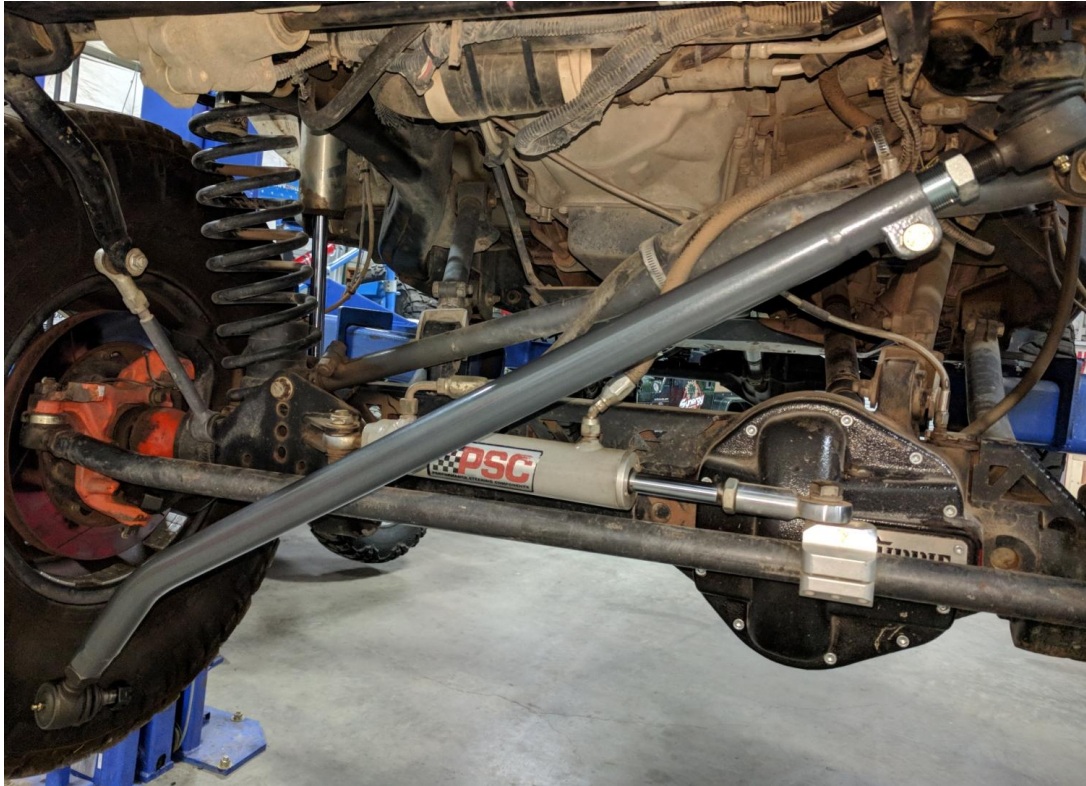
Figure 3. Drag Link Installed In Pitman Arm