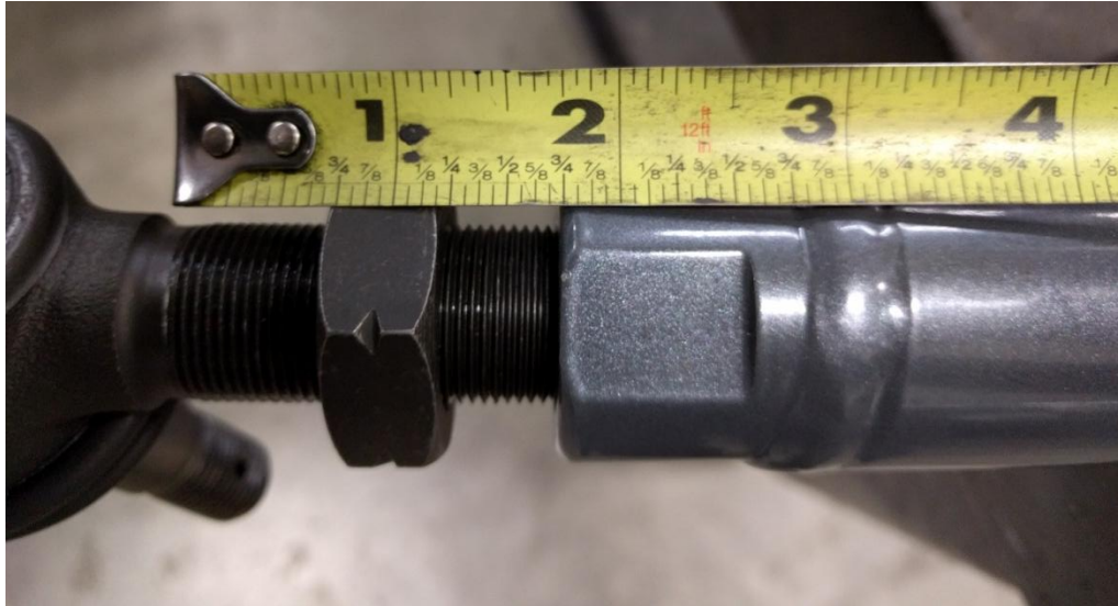
Figure 5. Minimum Thread Engagement on Knuckle Side of Drag Link

DO NOT ADJUST KNUCKLE SIDE TIE ROD END OUT SO THAT MORE THAN 1.75" OF THREAD IS SHOWING (NOT INCLUDING JAM NUT) SEE FIGURE 5.