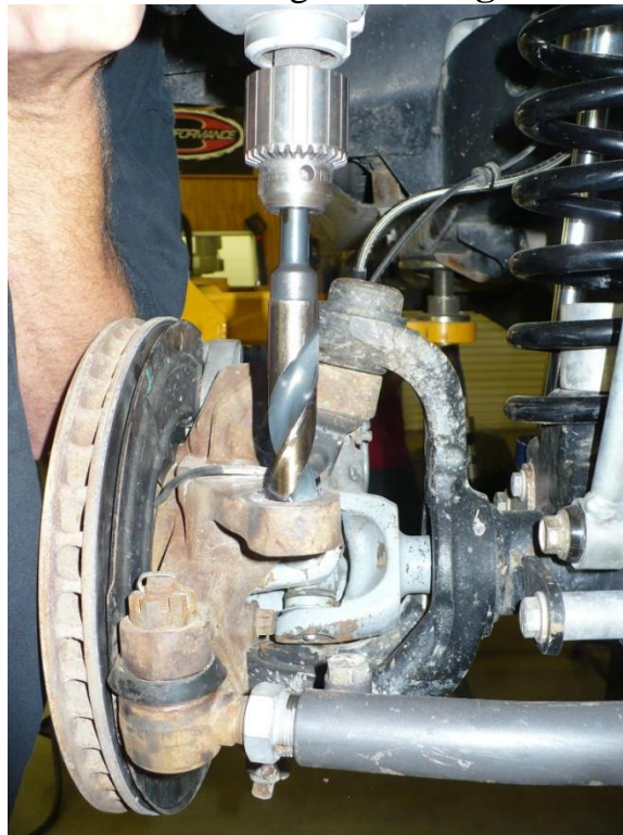
Figure 1. Drilling out Knuckle for Flip Adapter