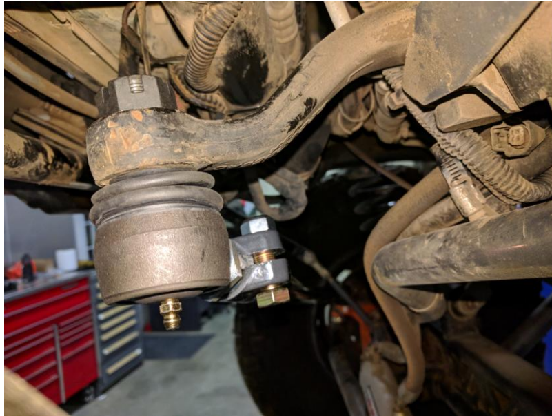
Figure 9. Correctly Oriented Drag Link