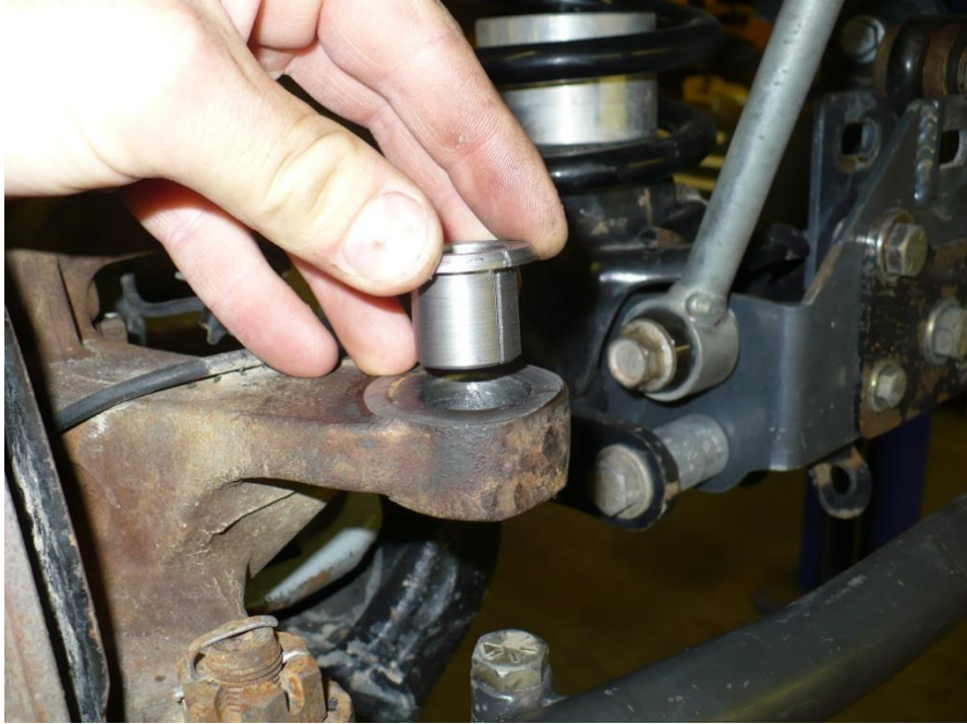
Figure 2. Flip Adapter Being Installed in Knuckle