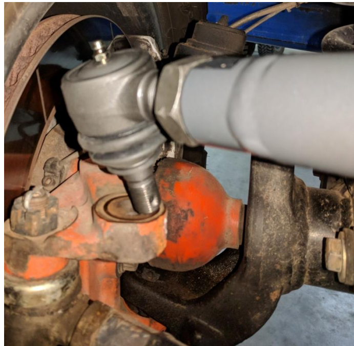
Figure 4. Drag Link at Knuckle End – Needing to be Adjusted to Fit