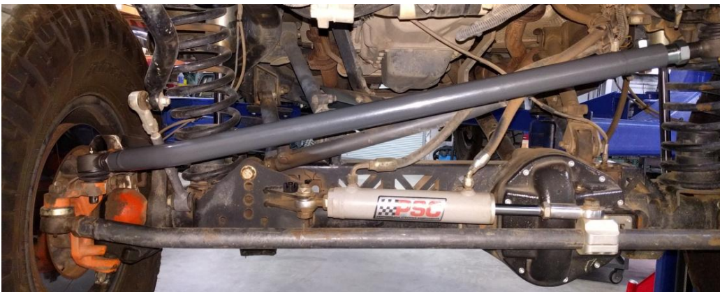
Figure 8. CORRECT Orientation of Drag Link