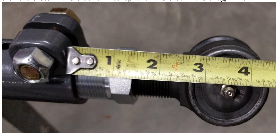
Figure 6. Maximum Length on Double Adjuster (Pitman Arm) Side

14. Attach the straight end (with double adjuster) of the drag link to the pitman arm with a castle nut. Leave the castle nut hand tight. Swing the bent end of the drag link over towards the steering knuckle and observe the length change required to get the tie rod end to install in the hole in the knuckle. Adjust the drag link length with the adjuster sleeve at the pitman arm side as needed to get the tie rod end to drop into the hole on the knuckle. Make sure the adjuster sleeve end is adjusted by turning the adjuster sleeve and not the tie rod end. The amount of thread of the adjuster sleeve and tie rod end showing should be the same. DO NOT THREAD THE DOUBLE ADJUSTER TIE ROD END OUT FARTHER THAN THE 3.5" SHOWN IN FIGURE 6. If the adjuster is all the way out and the steering still does not line up, turn the adjuster back in a few turns. Remove the knuckle side tie rod end from the knuckle and thread it out of the drag link farther until the wheel is aligned. We recommend rotating the sleeve until one of the slots in the sleeve lines up with the slot in the drag link.