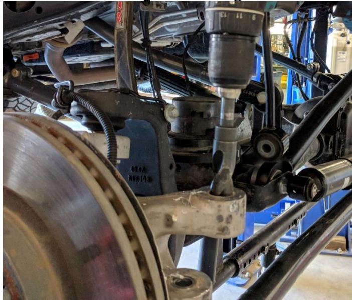
Figure 3. Drilling out Steering Knuckle