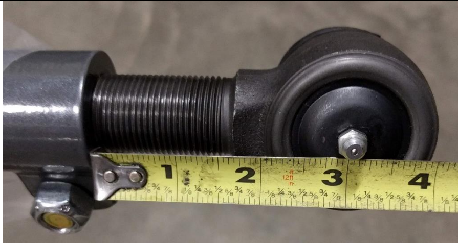
Figure 5. Maximum Length on Non-Double Adjuster (Knuckle) Side

14. Attach the straight end (with double adjuster) of the drag link to the pitman arm with a castle nut. Leave the castle nut hand tight. Swing the bent end of the drag link over towards the steering knuckle and observe the length change required to get the tie rod end to install in the hole in the knuckle. Adjust the drag link length with the adjuster sleeve at the pitman arm side as needed to get the tie rod end to drop into the hole on the knuckle. Make sure the adjuster sleeve end is adjusted by turning the adjuster sleeve and not the tie rod end. The amount of thread of the adjuster sleeve and tie rod end showing should be the same. DO NOT THREAD THE DOUBLE ADJUSTER TIE ROD END OUT FARTHER THAN THE 3.5" SHOWN IN FIGURE 6. If the adjuster is all the way out and the steering still does not line up, turn the adjuster back in a few turns. Remove the knuckle side tie rod end from the knuckle and thread it out of the drag link farther until the wheel is aligned. We recommend rotating the sleeve until one of the slots in the sleeve lines up with the slot in the drag link.