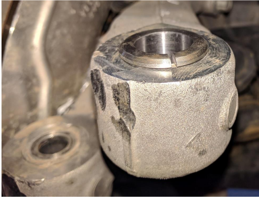
Figure 4. Flip Adapter in Steering Knuckle