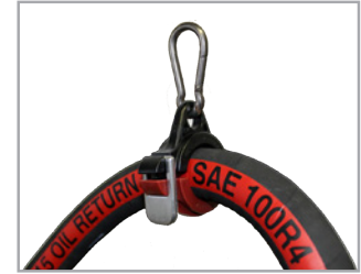
1.50" Clamp with common 100R4 hydraulic hose