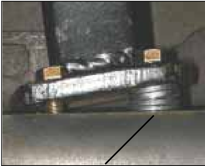
Looking up from bottom of truck