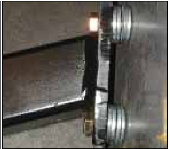
Looking toward rear of truck