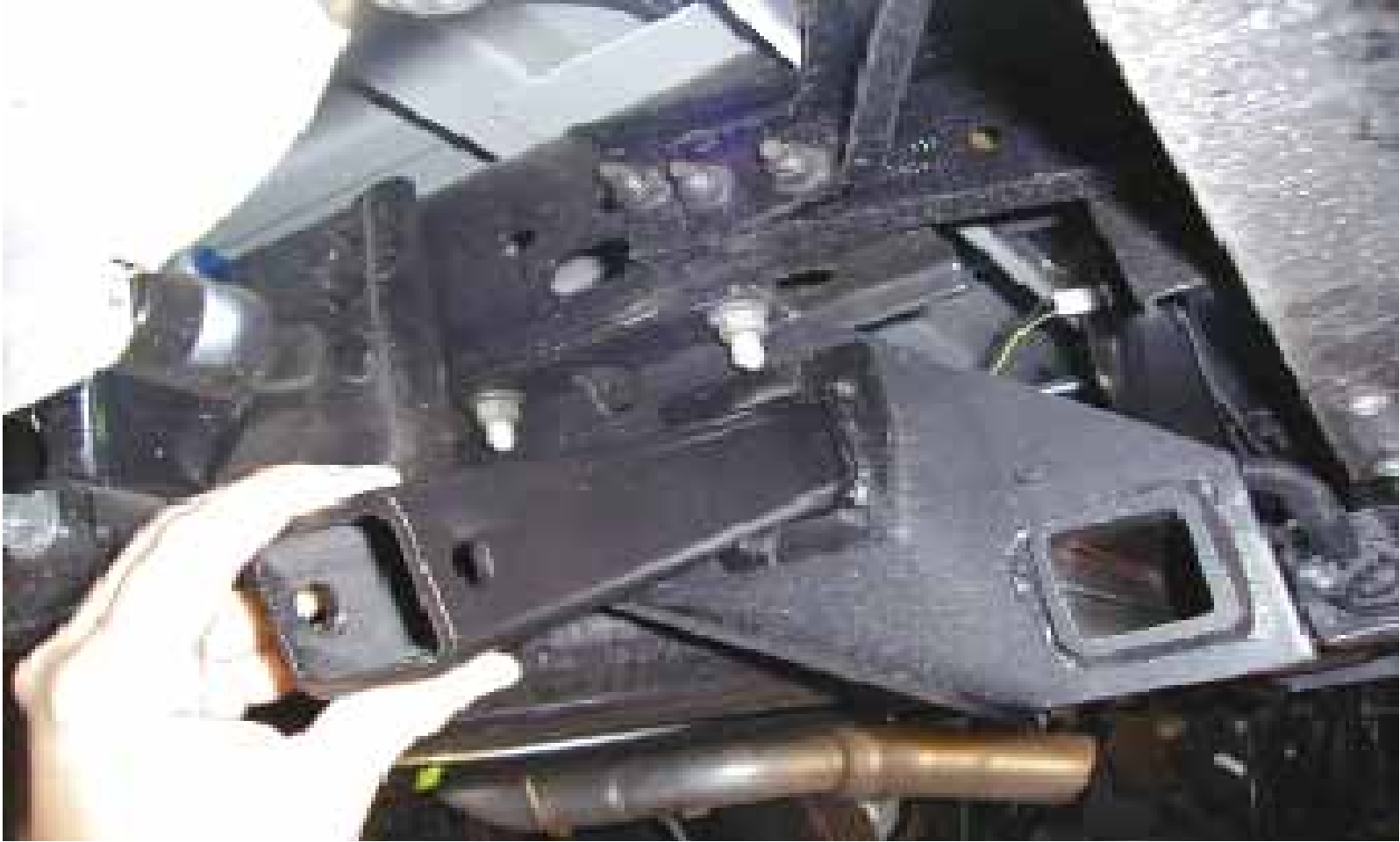
OUTSIDE VIEW "B"