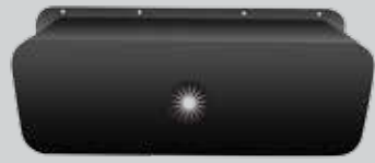
UNIVERSAL ASSEMBLY BUCKET

A housing bucket is included for Kenworth, Freightliner & Western Star models, allowing you to protect your trucks' wires from corrosion.