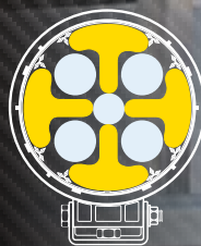
Spot Beam & Strobe