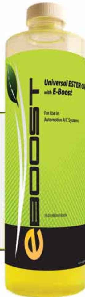
Universal ESTER Oil 16oz (480ml) Bottle