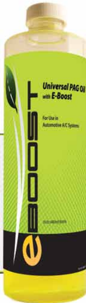
Universal PAG Oil 16oz (480ml) Bottle