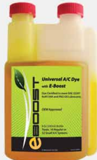
8oz (240ml) Bottle Services 16 Vehicles or 32 small A/C Systems