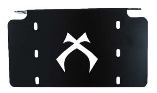
Part # - 4000308 Item # - XIL-LICENSEP License Plate Bracket for Light Bars up to 20"