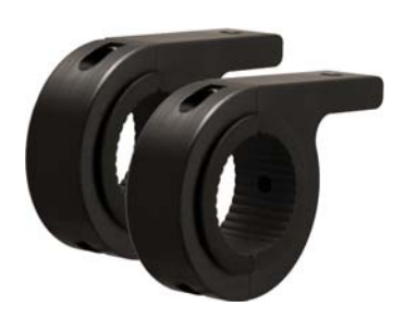
CLAMP TUBE MOUNT (0.75"-3.0" Diameters Available)