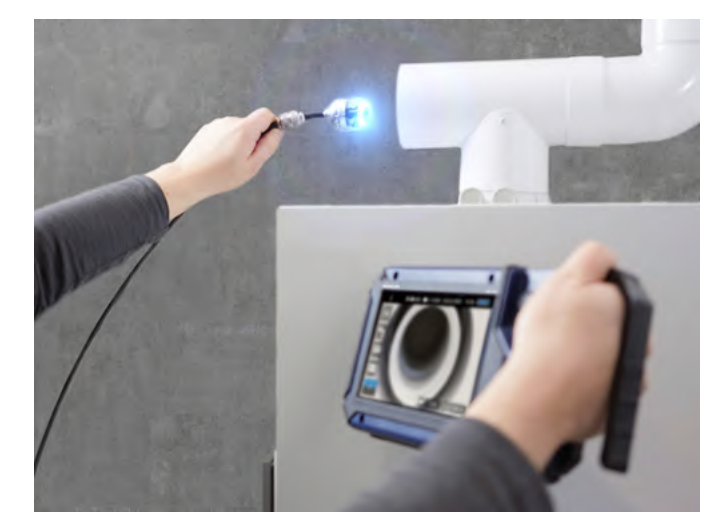
Inspection of flue gas lines from 2": easily negotiates tight bends of 87°.