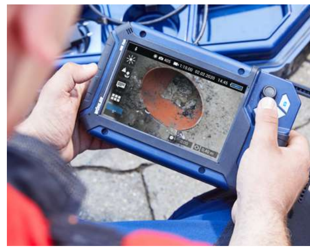
Razor sharp pictures in HD-quality, clear menu and comfortable to hold.