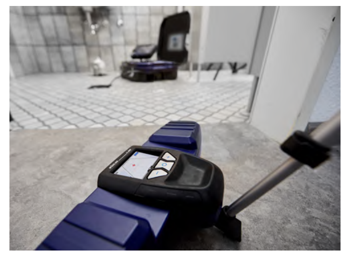
Precise location of the camera head with the Wohler L 200 Locator.