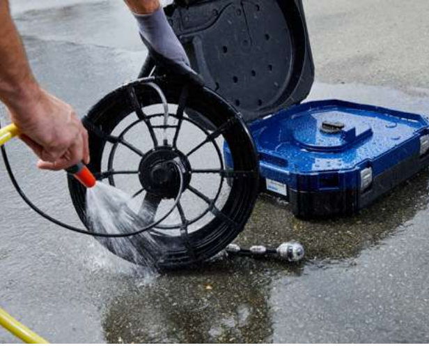
Fast cleaning for lasting hygiene: Wash the case and the push rod with water. The adjustable focus makes it possible to precisely control the depth of focus.