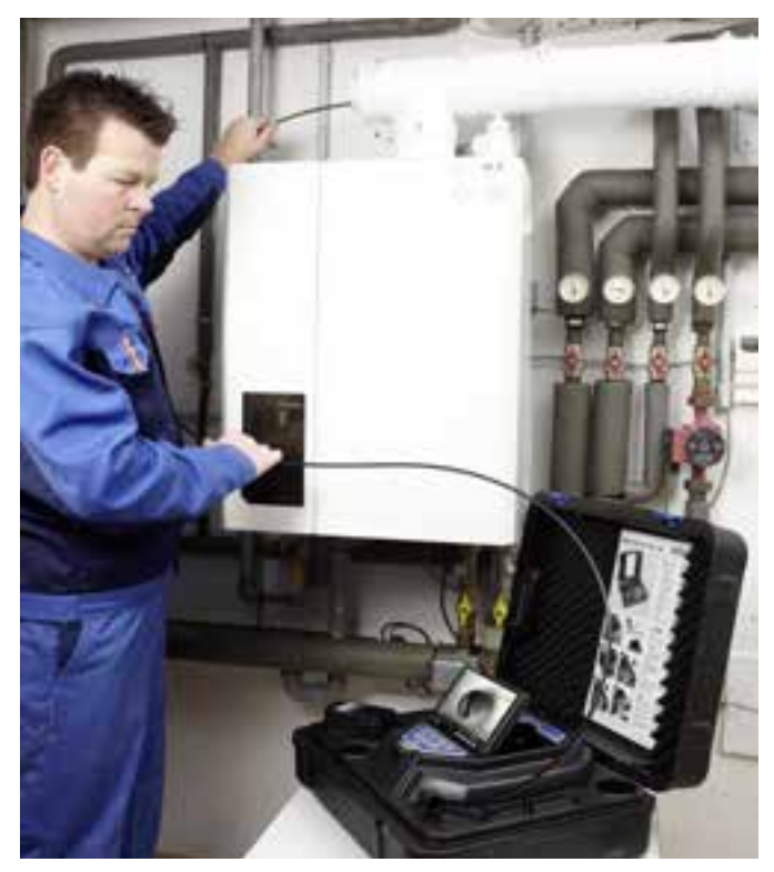
The service camera is an essential partner in a wide range of applications including the analysis of flue gas installations.