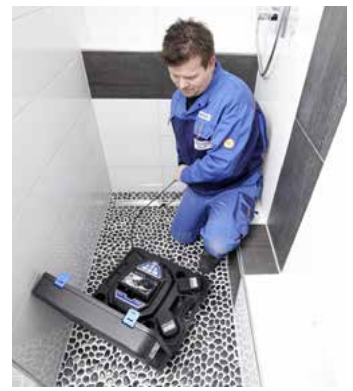
Wohler's new camera system is both compact and safely stored in a plastic case for transport and mobility.