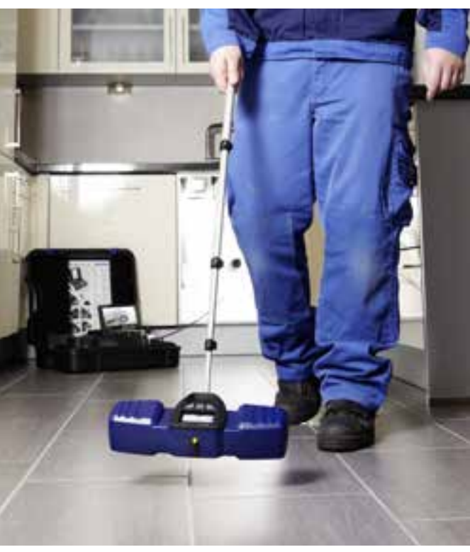
The actual meter count and the position of the head are displayed in the monitor. The Wohler L 200 Locator makes it possible to locate the camera.